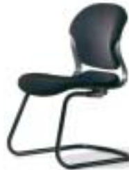
Equa 2 Side Chair