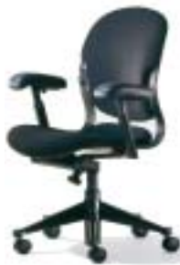
Equa 2 Work Chair