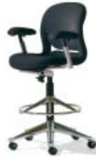
Equa 2 Stool

The one-piece Equa shell is composed of a strong yet flexible plastic permeated with color to reduce fading and make minor scratches unnoticeable. Equa 2 components are composed primarily of recycled materials.